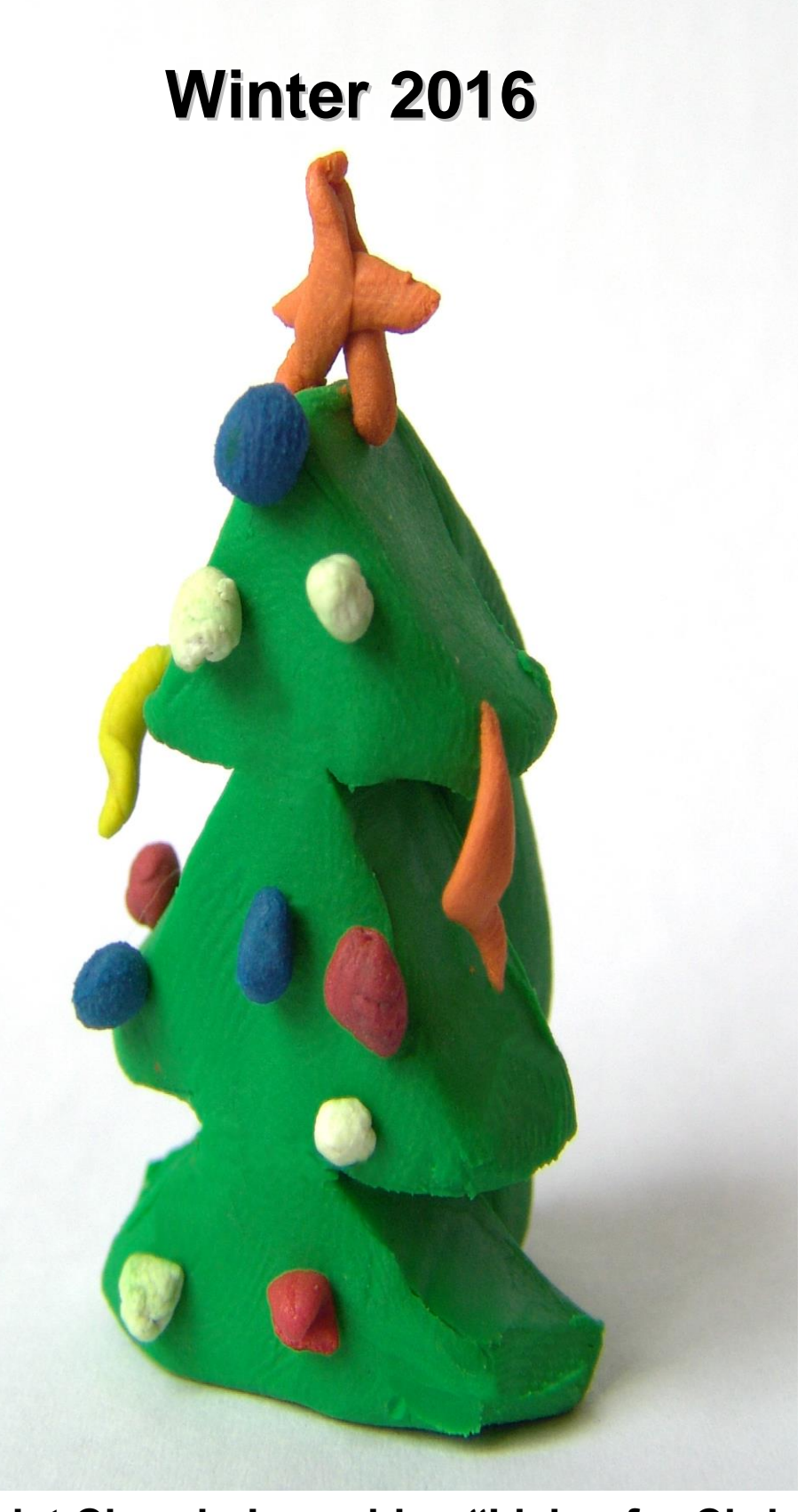
Christ Church, Longridge "Living for Christ at the heart of the community" www.christchurchlongridge.org.uk