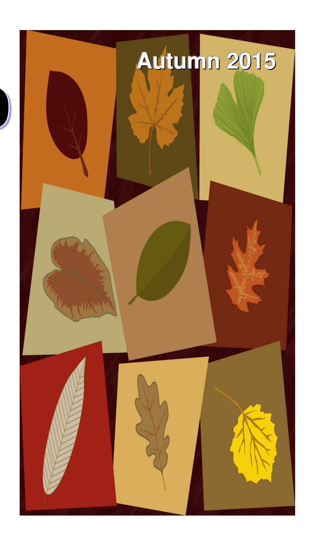
Christ Church, Longridge "Living for Christ at the heart of the community" www.christchurchlongridge.org.uk